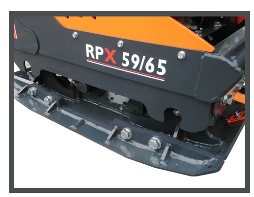
2 X 75MM OR 2 X 125MM BASEPLATE EXTENSION PLATES AVAILABLE AS AN OPTION