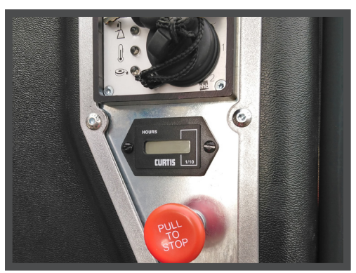
HOURMETER AS STANDARD ON PETROL & DIESEL ELECTRIC MODELS