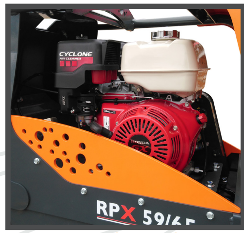
HONDA GX390 (CYCLONE) PETROL ENGINE MODEL AVAILABLE