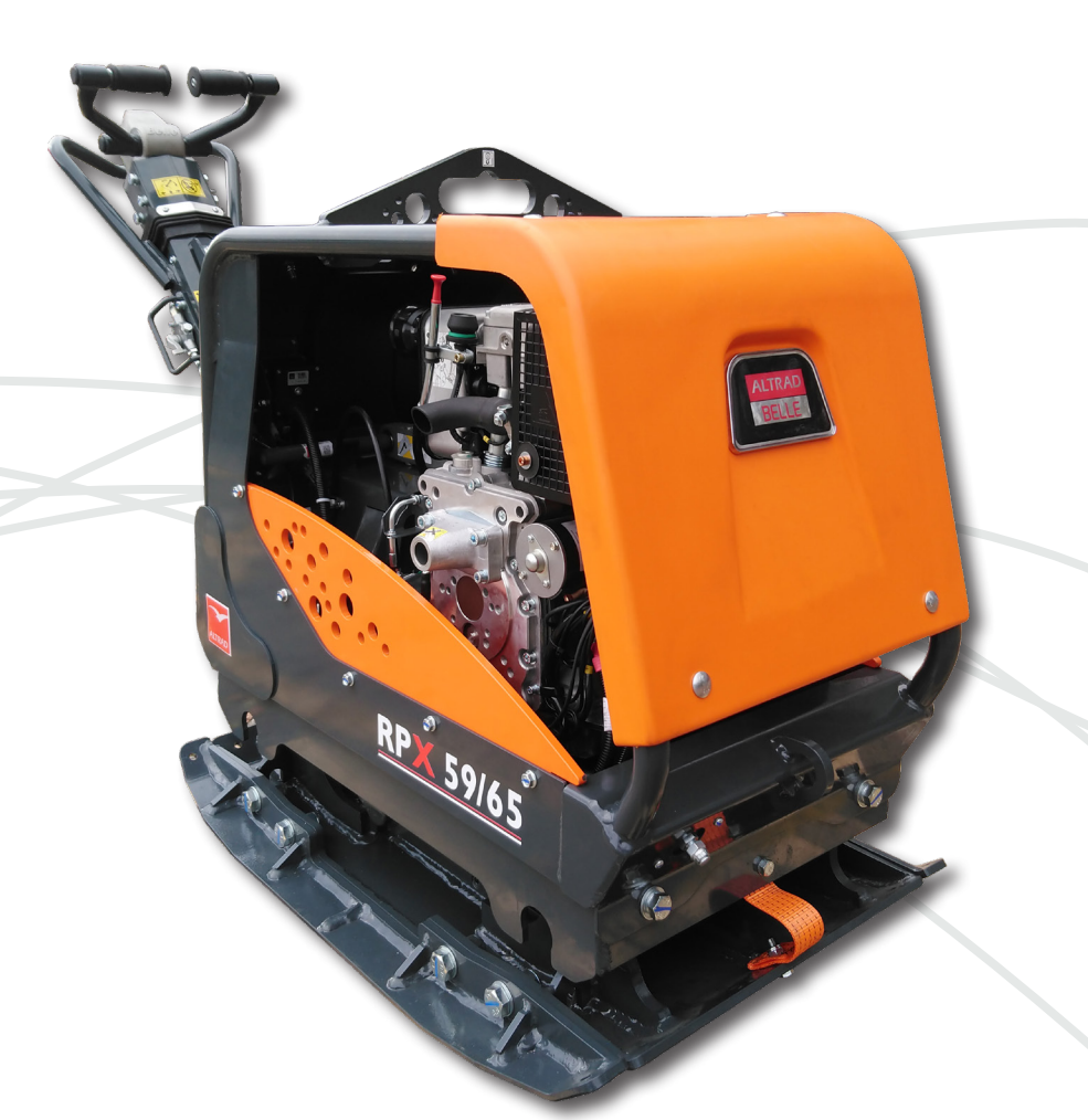
ELECTRIC, KEY IGNITION START & LED WARNING LAMPS (DIESEL ELECTRIC MODEL)