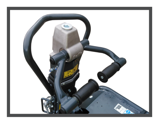
FIXED HANDLE TO AID MANOUVERABILITY