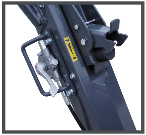
HANDLE MOUNTED THROTTLE, PERFECT FOR THE OPERATOR